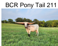
BCR Pony Tail 211