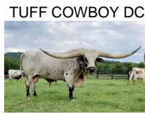
TUFF COWBOY DC