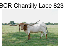
BCR Chantilly Lace 823