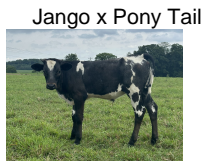
Jango x Pony Tail