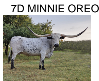
7D MINNIE OREO